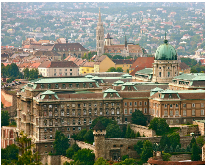
Buda Castle, Budapest

Itinerary subject to change. Meals in bold included in the price of the tour.