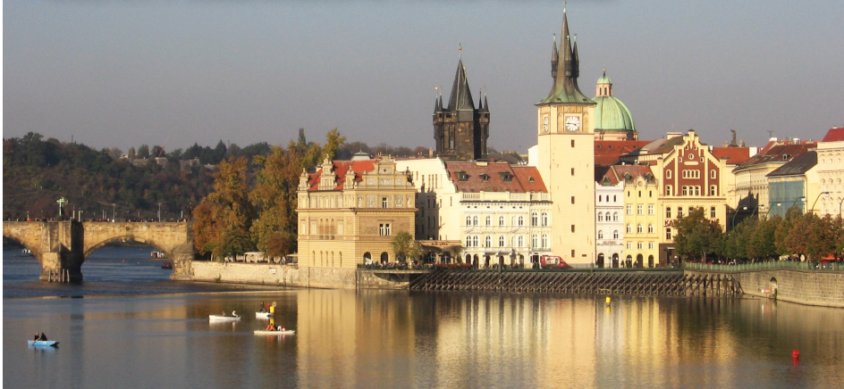
Prague on the Vltava

Budapest, Vienna and Prague with ETV Endowment of South Carolina