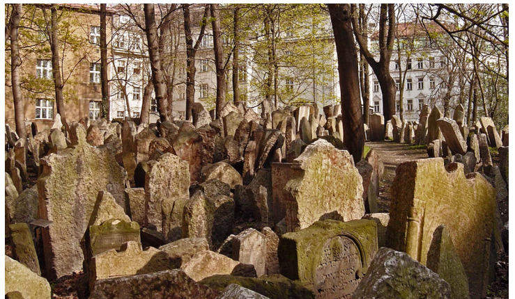
top: Abbey of Melk below: Old Jewish cemetery, Prague