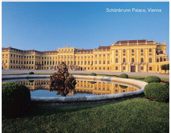
Schönbrunn Palace, Vienna

The Imperial Treasures tour is an exclusive presentation by ETV Endowment of South Carolina and is organized by The Grand Tour Travel Company, Peterborough, New Hampshire.