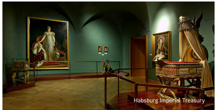
Habsburg Imperial Treasury